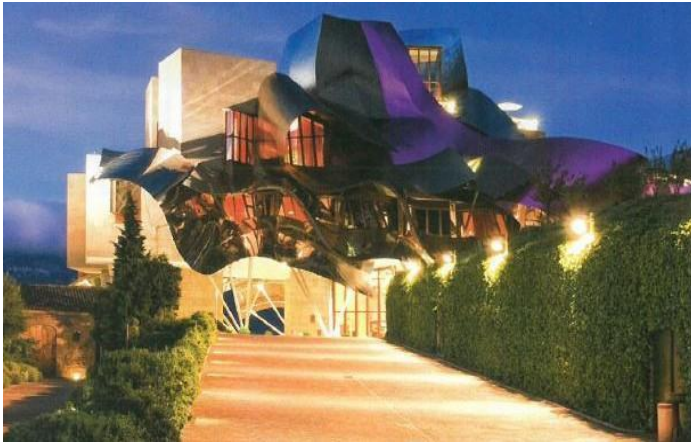
MARQUES DE RISCAL WINERY, LA RIOJA