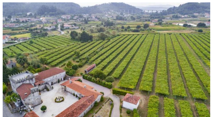
PAZO TORRE PENELAS FAMILIA TORRES ESTATE IN GALICIA