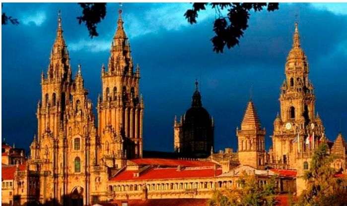
SANTIAGO DE COMPOSTELA CATHEDRAL