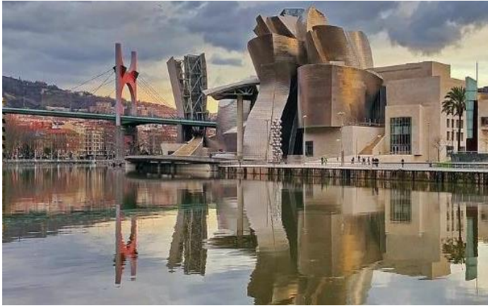
GUGGENHEIM MUSEUM, BILBAO