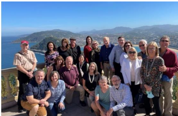
LA CONCHA BEACH, SAN SEBASTIAN